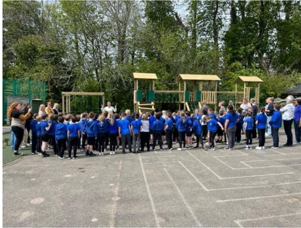
The official opening, 4 th May 2023!